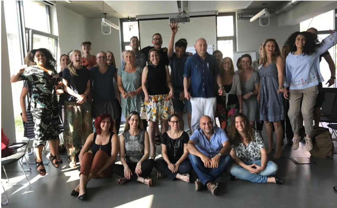
Participants of the 2nd Basic-Training at Pfefferberg (Berlin) in April 2018

The Berlin Center for Presence and Competence in Relationships (PUK) was founded by Pfefferwerk Stadtkultur gGmbH in 2017 on the basis of longstanding experience with different social work concepts that aim to strengthen the relationship between parents and their children as well as their social networks. The social work and therapy concepts it applies center on working with multi family groups as well as social and professional support networks. In a closely cooperation with schools we also enable them to be a present partner and take their responsibility too. This implies a paradigm shift in how we view the role of educators and professionals - from the role of offering direct care and support towards the task of strengthening the clients' family relations and resources ( www.praesenzundkompetenz.de ).